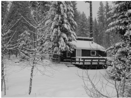
This is how camp was looking this winter.

Plan now to attend the Camp Clean up weekend May 22nd thru 25th.