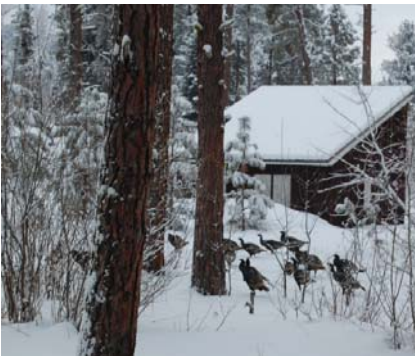
Lots of clean up to do after such a long winter's nap.

Plan now to attend Camp Clean up weekend May 27th—30th Each year we use this time to open and clean all the cabins, bathrooms, dining hall, etc. and get them ready for the season. There will be pine needles and brush to clear and repairs to do. See below for a complete schedule of events.